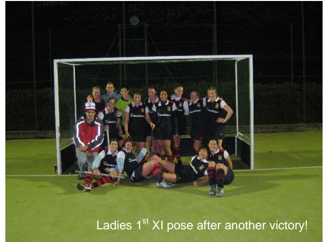
Ladies 1 st XI pose after another victory!

have high hopes for next term. We are the only team in the hockey club to still be in BUCS cup and I see no reason why we shouldn't be in the ULU cup final again this year, hopefully to win back our title. Socially we are all very active team with a great team spirit.