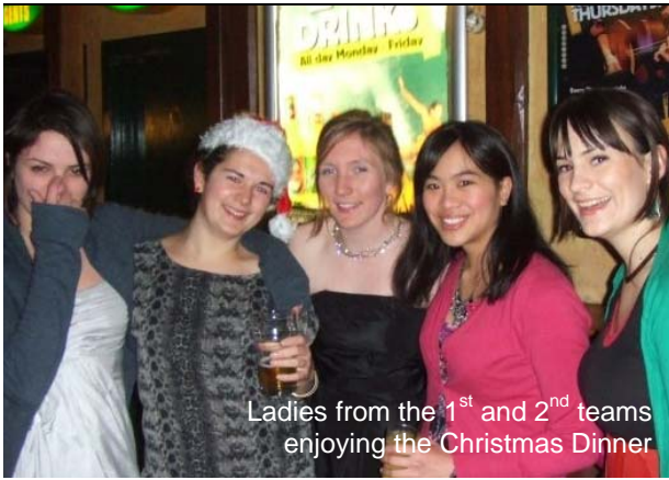
Ladies from the 1 st and 2 nd teams enjoying the Christmas Dinner

With this term's socials, we wanted to help our large number of new freshers integrate into the club. To this end, we have had a couple of four-team curry nights, mixing ladies' and men's teams, in addition to the regular fixtures of pub golf, and ACC bar nights. Another highlight of the first term was this year's Freshers' tour to a rather cold and rainy Brighton. In preparation for Sunday's hockey back in London, Saturday night was spent out for a meal on Brighton's main 'strip', followed by a bar selling funny coloured shots, and a surprisingly classy-looking club. Fish and chips, and a paddle in the sea were also enjoyed, before our return to London to triumph in our mixed game.